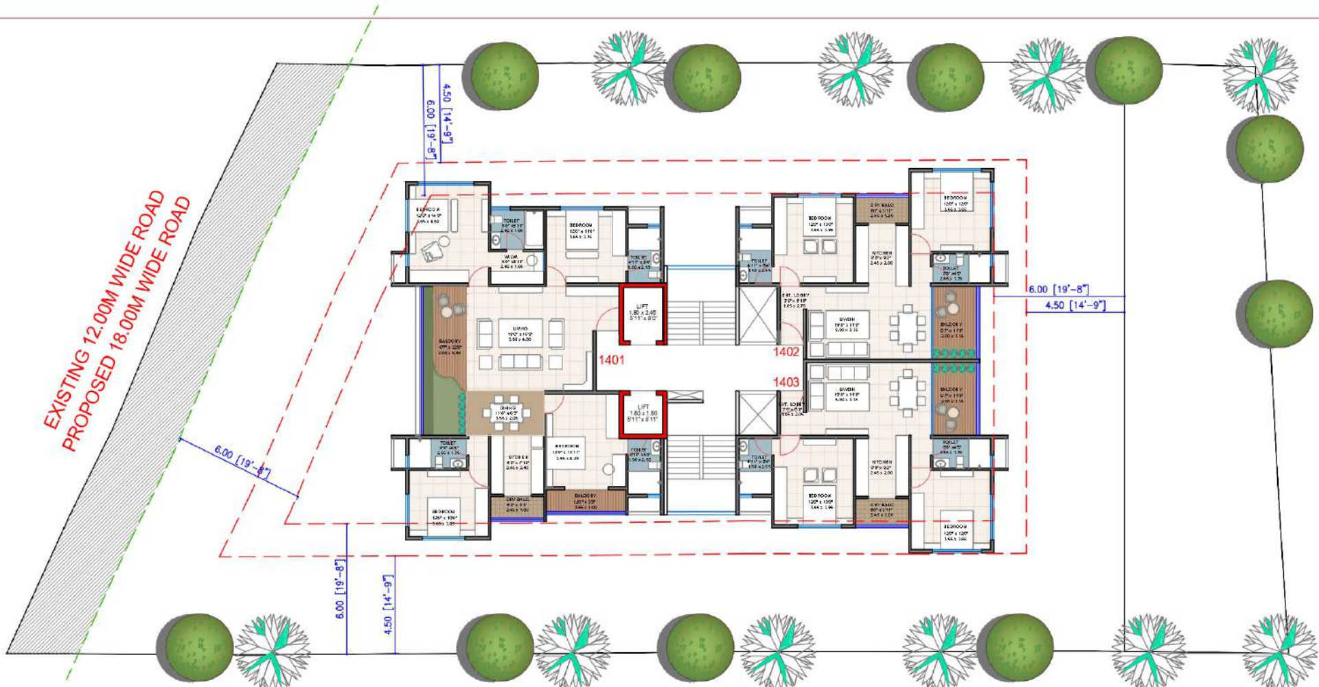
SALABLE AREA STATEMENT (SQ.FT)

EXISTING 12.00M WIDE ROAD PROPOSED 18.00M WIDE ROAD