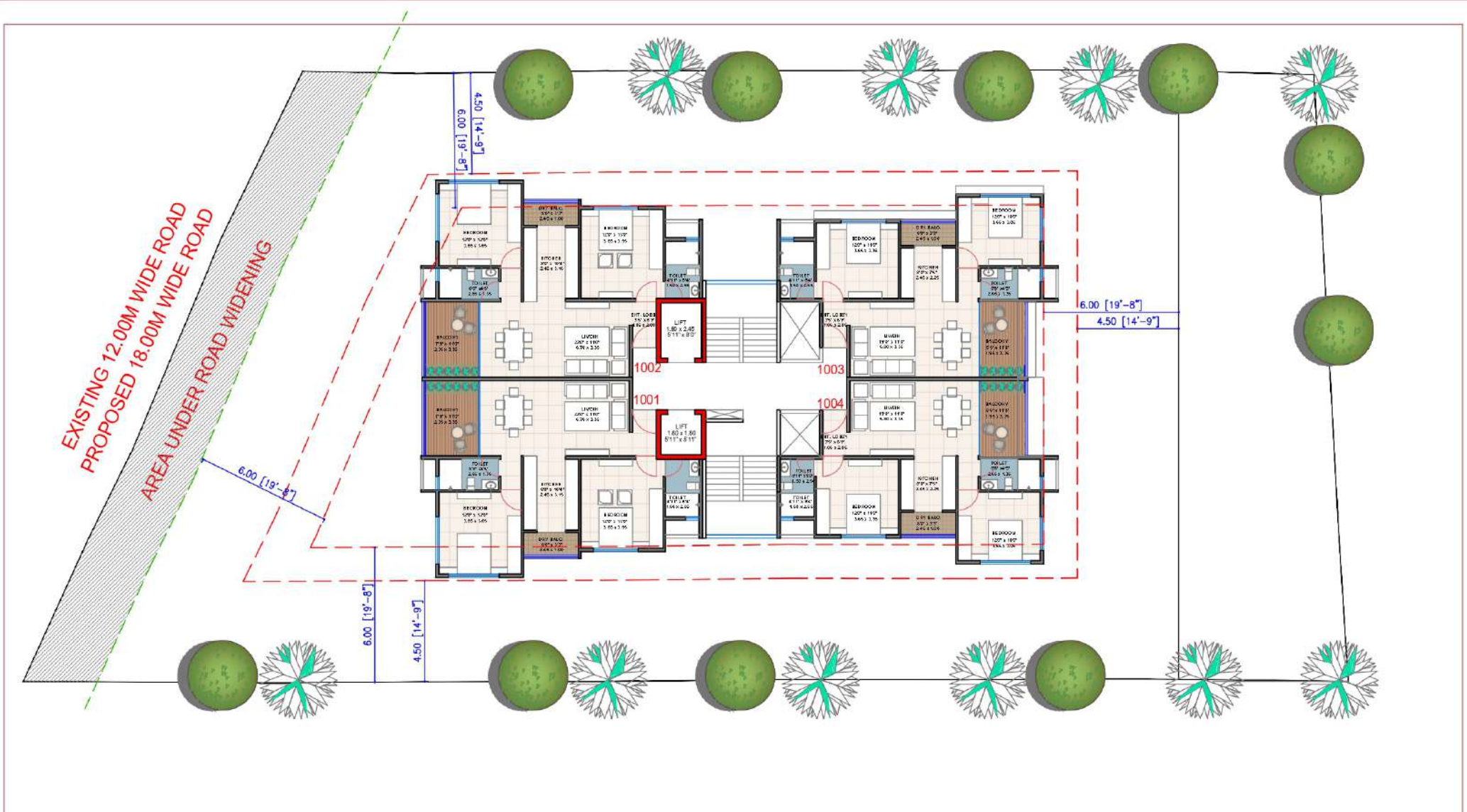
SALABLE AREA STATEMENT (SQ.FT)