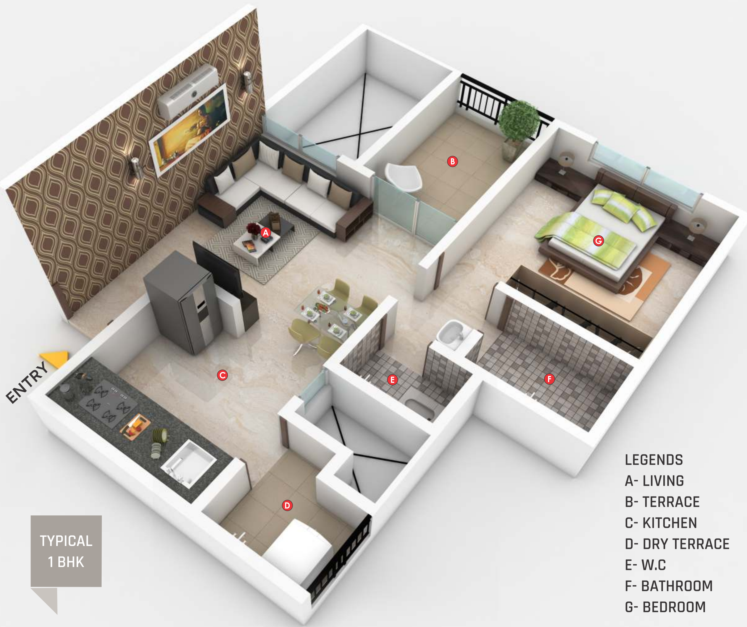
TYPICAL 1 BHK