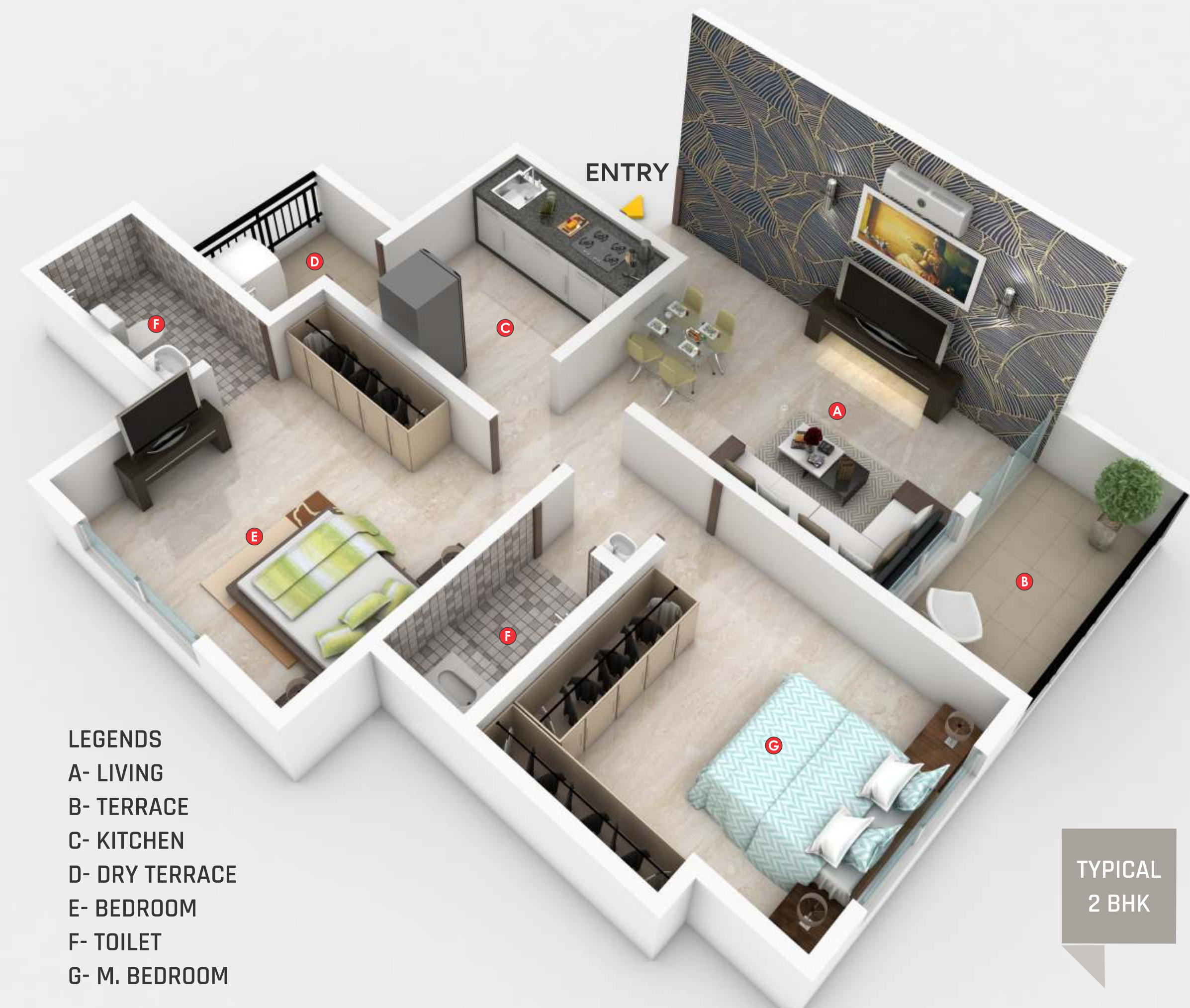
TYPICAL 2 BHK