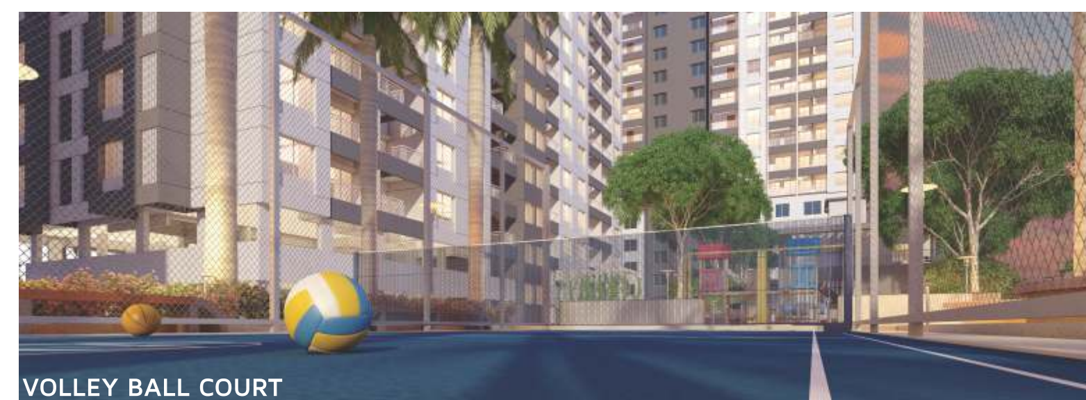
VOLLEY BALL COURT